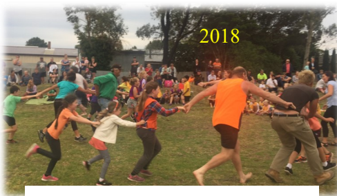
Last year's Welcome Barbecue was a lot of fun

This annual event is scheduled for next Tuesday 19th February . We do hope as many families can make it as possible. It is a double opportunity this year for parents to meet our staff and other families. Activities will be run on the oval from 6.45 to 7.30pm.